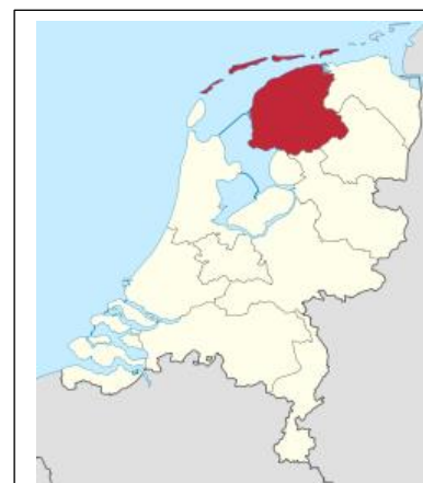
Fryslân Province in the Netherlands

Friesian, or Frysk, is an old language dating back to the Middle Ages when Fryslân stretched from Belgium to Northern Germany. The province of Fryslân is 5,749 km 2 and in 2010 had a population of 646,000. It is located in the North West corner of The Netherlands. The province is well known for its black and white cattle and large black horses as well as its ice skating competitions skating on the canals between 11 cities and towns across the province.